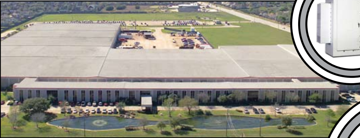
North American Headquarters and Manufacturing Facility (Houston, TX)