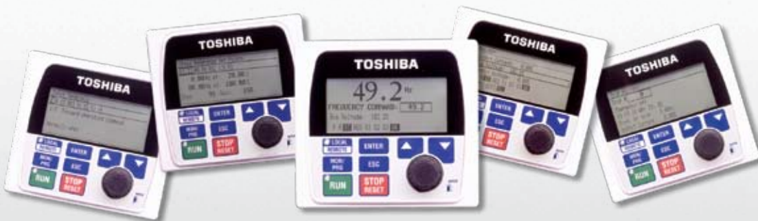
Standard Keypad Design for Low Voltage and Medium Voltage Drives