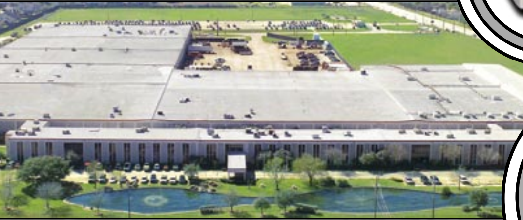
North America Headquarters & Manufacturing Facilities (Houston, TX)